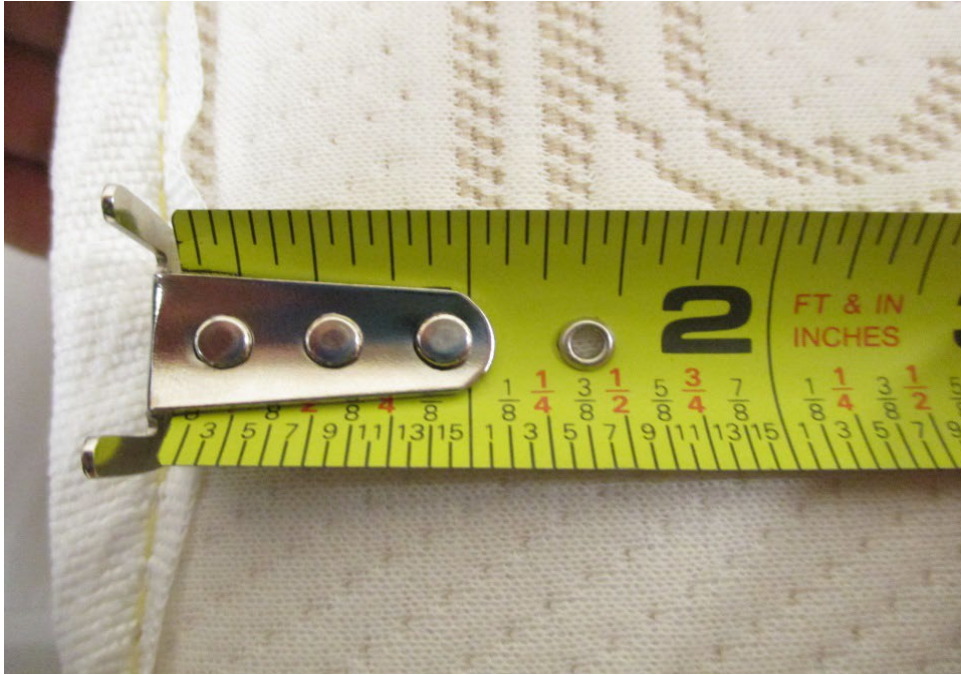
Figure 5: Mattress Pad (INCORRECT – DO NOT measure beyond seam)