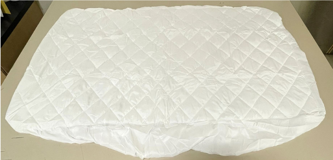
Figure 2: Mattress Pad with Elastic – Two Corners Cut