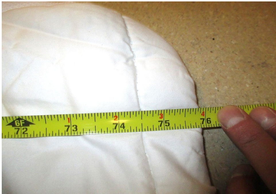
Figure 7: Mattress Pad (INCORRECT – DO NOT measure at curvature)